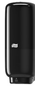
Tork Soap-Sanit Disp – Int Sens, bl 561608