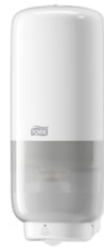
Tork Soap-Sanit Disp – Int Sens, wh 561600