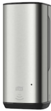
Tork Soap-Sanit Disp – Int Sens, SS 460009