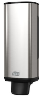
Tork Skincare Dispenser 460010